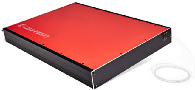
Fiber Amplifier (A20)

Leonardo is a US-based maker of all critical components in the laser pump source as a fully integrated manufacturer. This eases the challenges of customizing the design's aspects for optimal performance and minimizing size, weight and power (SWaP). Leonardo provides complete system integration, testing and qualification of diode components with micro-optics, beam shaping and beam conditioning optics, power supply and drive control electronics.